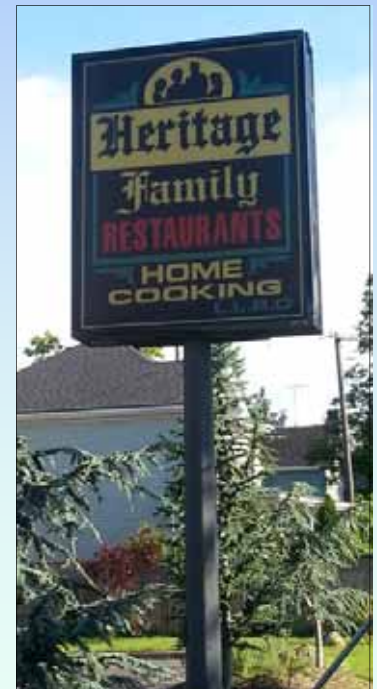
High-street visibility pylon sign