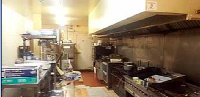
Full-service kitchen, 2 walk-in coolers, large prep area