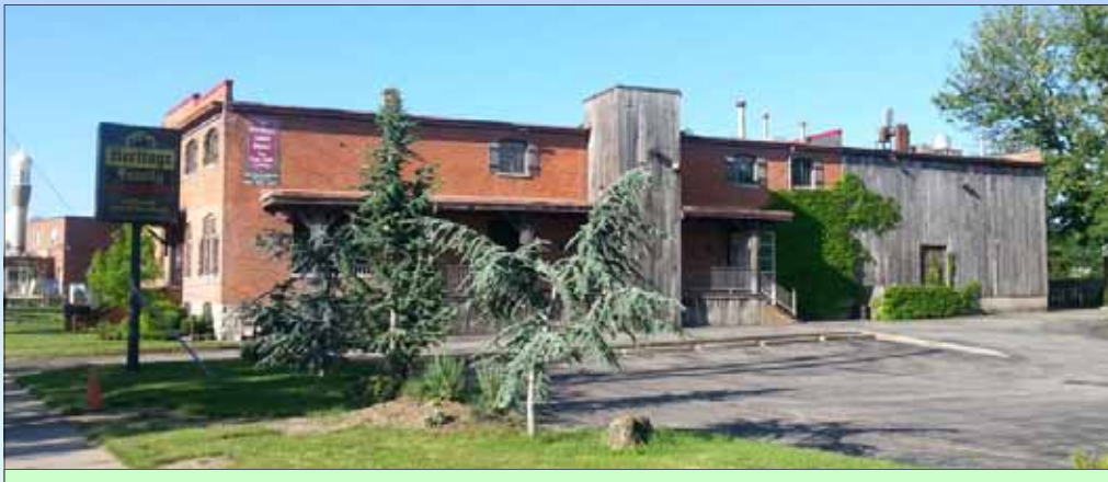
North side view, high profile pylon sign, north parking lot