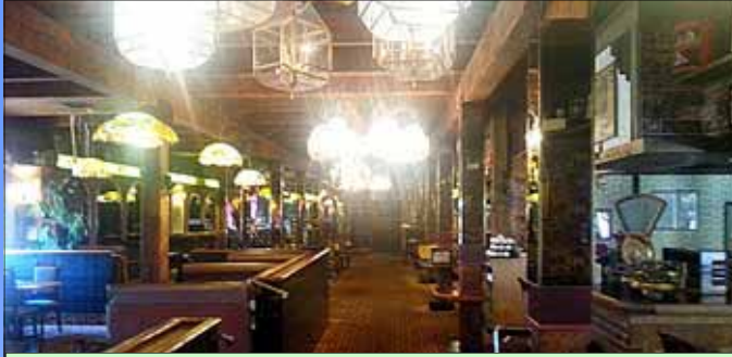
154 seats (ample room for more), 14-seat bar, 136 LLBO