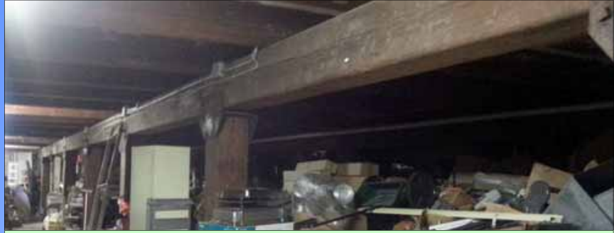
Exceptional character—heavy beams throughout, thick pine flooring