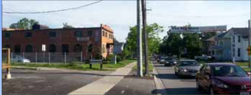
High traffic count AM & PM, 21,732 (2006) — 19.2% over growth 3 years